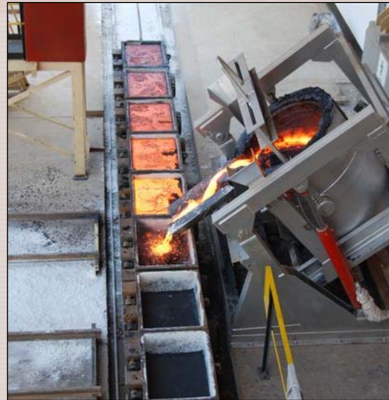
Kinsevere Stage I – Electric Arc Furnace